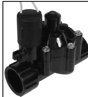
N-100S (1 in. SLIPxSLIP)*