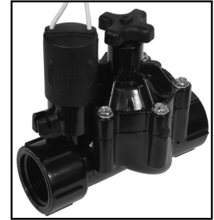
N-100F (1 in. FIP with flow control)*