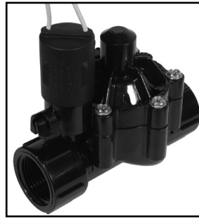
N-100 (1 in. FIP)*