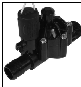
N-100MB (1 in. MALExBARB)*