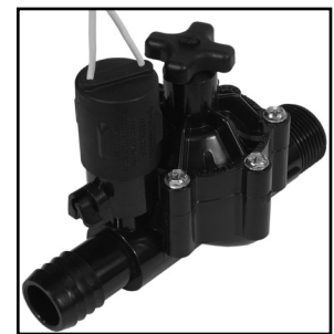
N-100MBF (1 in. MALExBARB with flow control)*