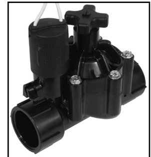
N-100SF (1 in. SLIPxSLIP with flow control)*